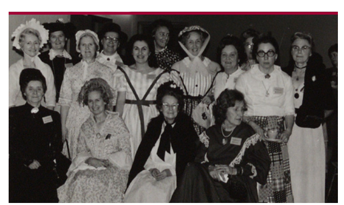
VWA 75th Anniversary Celebrations