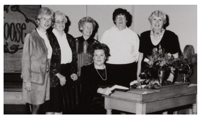
VWA 100th Anniversary Benefit Concert

However, the fundraising work of the VWA did not stop while Annesley Hall was being constructed nor during its general operation and furnishing of the