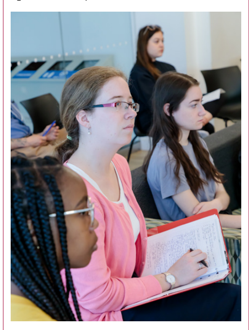
Vic Ready students

The couple acknowledge that universities in Canada and around the globe could take more of a leadership role in preparing students with the life skills they need to succeed beyond their undergraduate education. This is why they feel the Vic Ready program is so special. They commend Vic's current